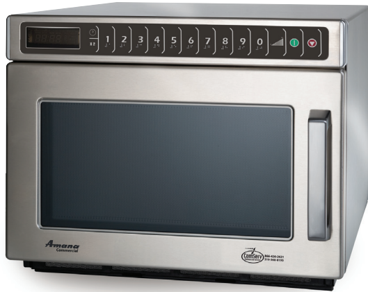
Model HDC182 shown